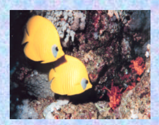
Steering Committee, U.S. Coral Reef Task Force February 26, 2003